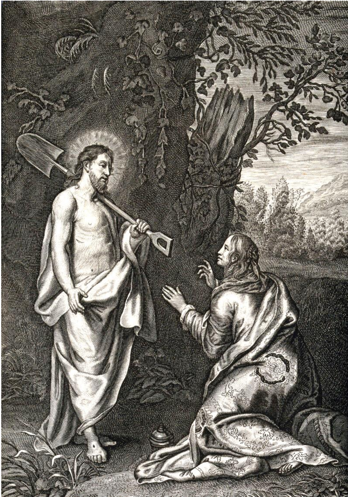
The risen Christ appears as gardener to Mary Magdalene; engraving by artist once known, but not credited.